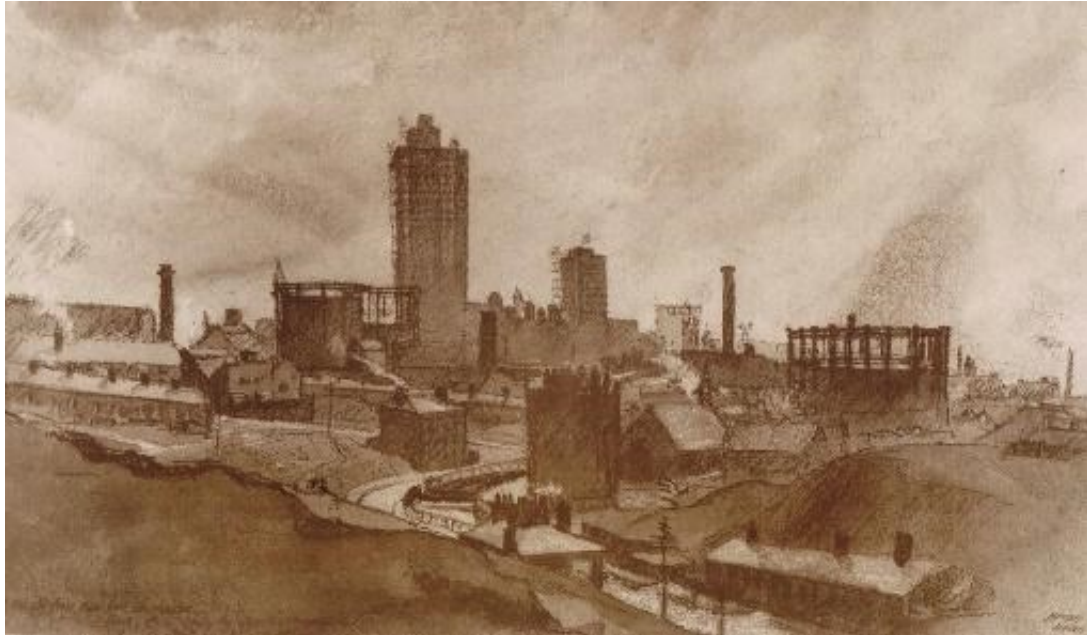
Construction of the CIS (Co-operative Insurance Society) tower blocks. Early 1960s, viewed from Collyhurst. Photo of the original picture (current whereabouts unknown)

This picture is set in the same area as a few of Brian's other paintings: